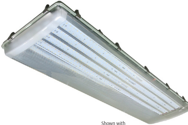
Shown with clear lens (Included)