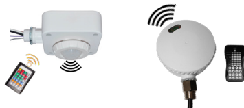
Optional Motion Sensors (Not Included) See Page A57